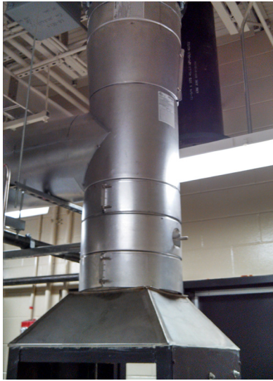
Laboratory fume hood applications shown with AMPCO factory-built double wall and single wall venting.